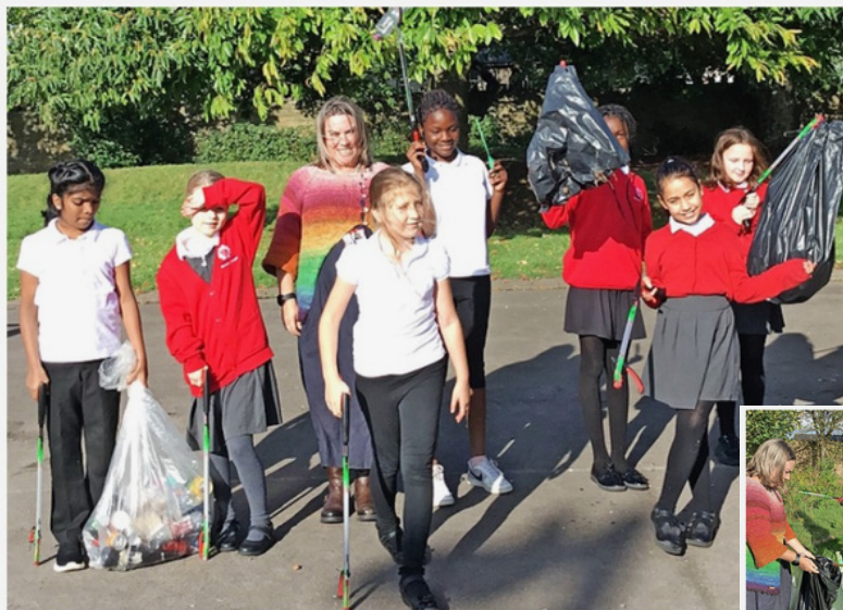
Pupils litter picking at The Mighty Girls afterschool club